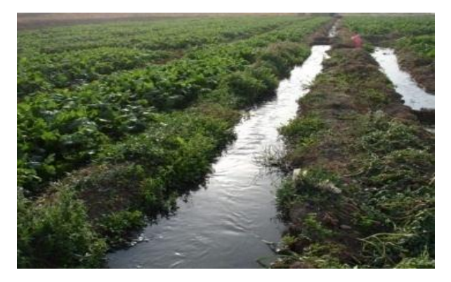
Fig. 5. Vast Farms for Uncooked Vegetable.