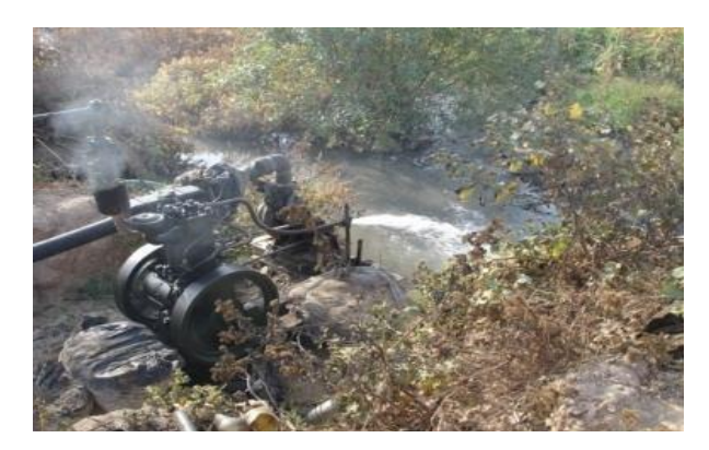
Fig. 3. Main Canal of the Sewage Water with Lifting Diesel Pumps.