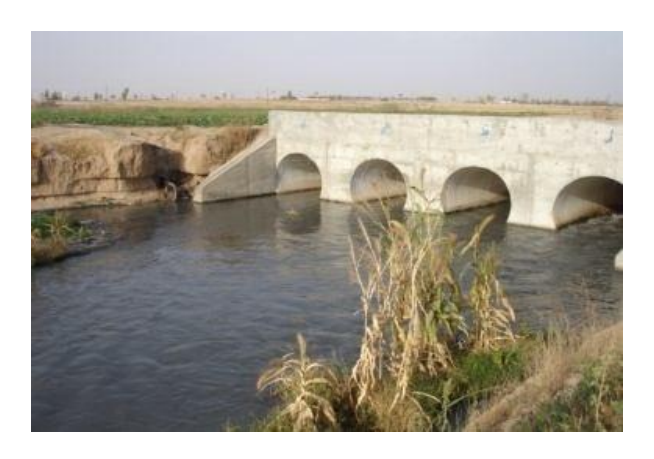
Fig. 2. Main Canal of the Sewage Water with Lifting Diesel Pumps.