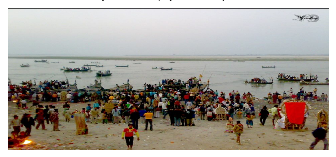
Fig. 2. A Simple View of Bathing Ghat (Ganga) in Patna, Bihar.