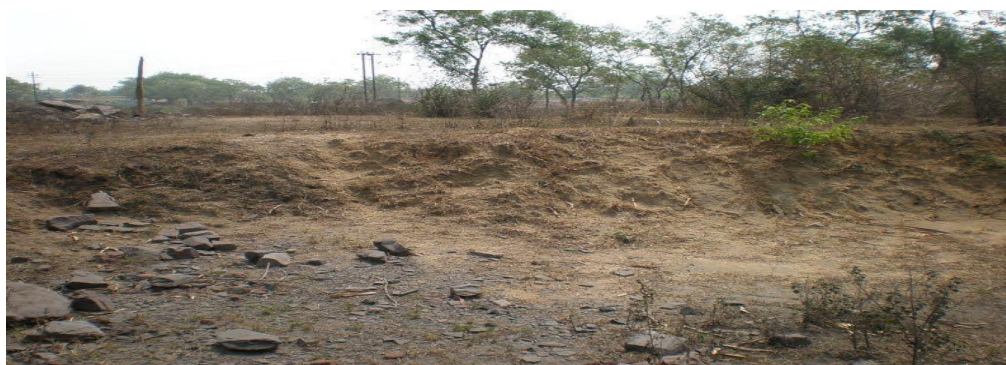
Fig. 2. Degradation of soil quality in Jharia coalfield, Jharkhand.

The environmental degradation affects the flora and fauna of the region to a large extent. Due to lack of proper planning and negligence of mining regulations, an appreciable amount of environmental degradation and ecological damage to soil occurs (Dhar, 1993). Dumping of huge amounts of mining waste materials from coal mining operations on agricultural land to destroy soil fertility causes delays ecological plant succession affecting local biodiversity of the Jharia coalfield (Jha & Singh, 1992). In Jharia coalfield, topsoils are not selectively handled as a result of the topsoil material gets mixed with overburden rock mass from coal mining operations and thus the soil fertility, an important resource for land management is lost slowly. Dalka et al. , 1976 reported that heavy metals associated with mining are known to have toxic properties if present in above certain levels. Wali, 1975 reported that heavy metals like Fe, Mn, Cu, Pb, Cd, Cr and Co etc. of which are known as essential elements for plant growth, but almost all become phytotoxic at higher concentration. However, there is scarcity of work on physicochemical characteristics of soil of coal mining areas in India. Environmental impacts of open-cast mining on land are summarized in Table 2.