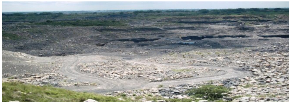
Fig. 1. Degradation of topsoil due to coal mining operations, JCF.