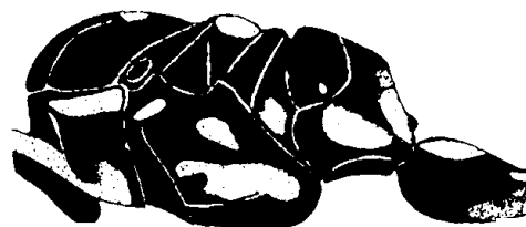
Fig. 2. Dorsal view of Abdomen.