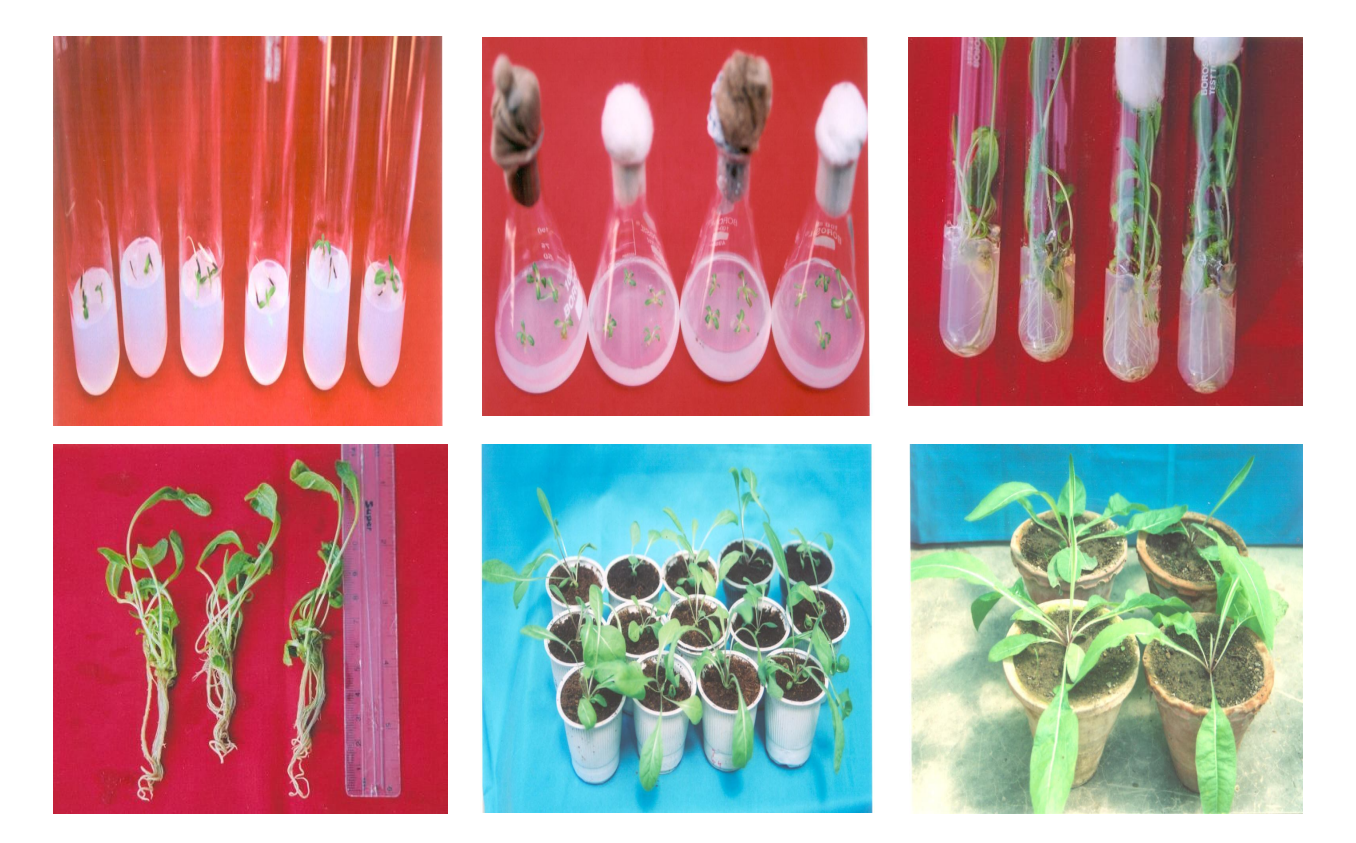
Plate 1. Different stage during in vitro propagation of Inula racemosa (a) germinating seedlings, (b) in vitro multiplying shoots (c) & (d) rooted plantlets, (e) & (f) hardened plants.

Rooted plantlets were transferred to greenhouse in order to perform the acclimatization process. After ten days, the plants tolerated gradual uncovering and lowering of relative humidity. After fifteen days of transferring to pots, the plantlets were totally uncovered. At complete acclimatization, 95% plantlets survived and are being maintained in the experimental field of the department of biotechnology. Different stages of micropropagation of Inula racemosa are presented in plate 1.